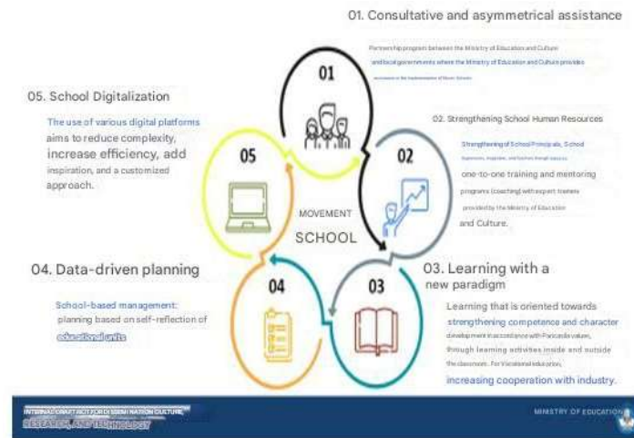
Figure 1. The School Mover Program Consists of Five Interventions

Based on the material of the workshop on strengthening the driving principles delivered by the Ministry of Education, Culture, Research and Technology, the 5 interventions above are described in the following scheme: